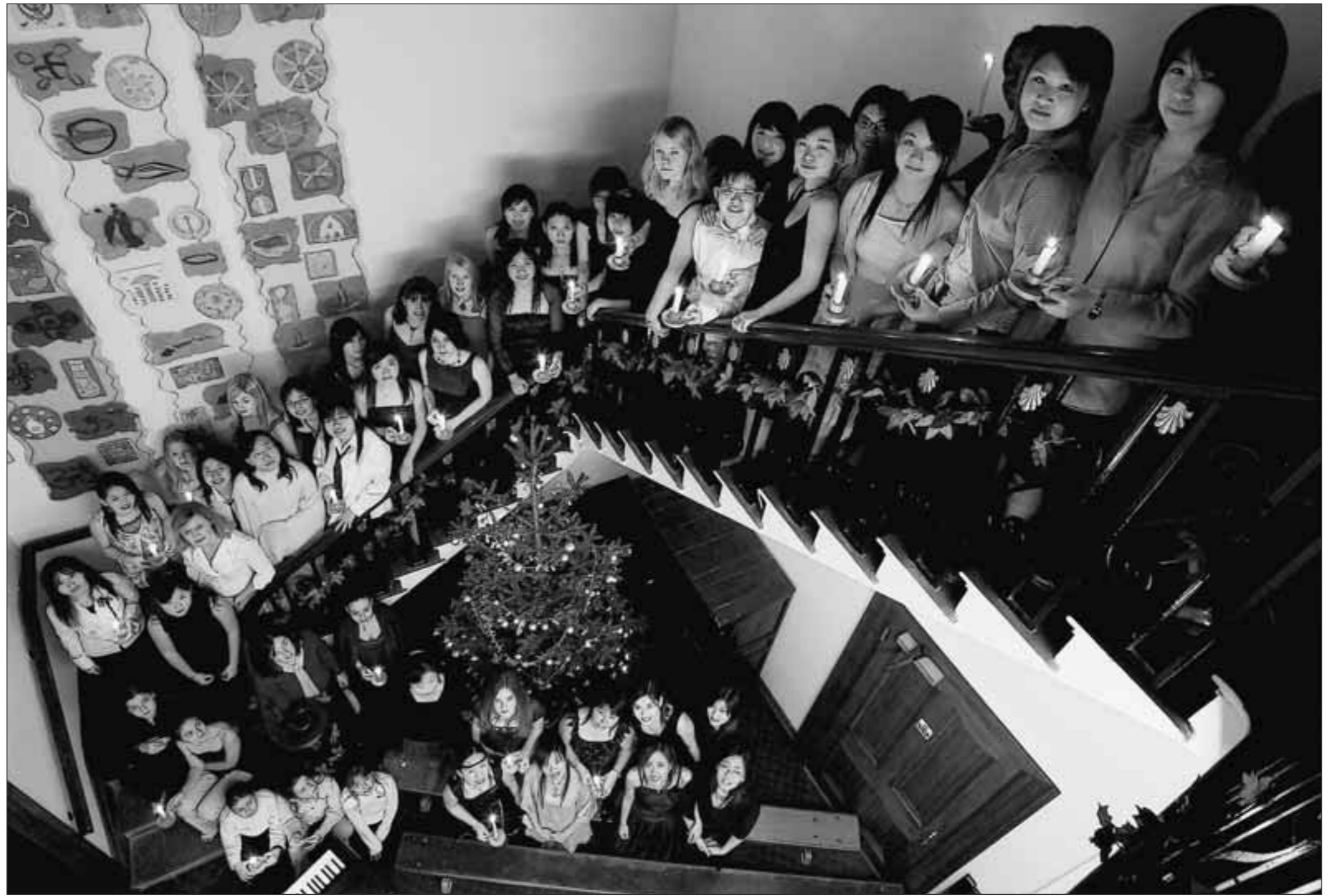
It began here: Christmas 2004 at Polam Hall, with the young boarders gathering in the stairwell where, in 1853, the first Christmas tree in the district was revealed

*Nothing in this ad - information provided or the receipt by Newsquest / your tour operator of your booking form is an offer to do business with you*